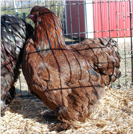
One of my original 2 hens from Ontario in 2013

happened, none the worse for their 3400 km (2100 mile) journey from Ontario to Alberta via livestock truck. But unfortunately, later that year the 2-year-old male suffered what appeared to be a heart attack before I could do any breeding with him. I did end up with a good selection of offspring from the 2 hens and cockerel.