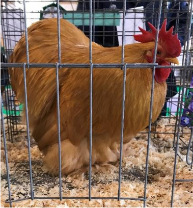
Donna Lamb's Buff Cockerel Green Mountain Poultry Show