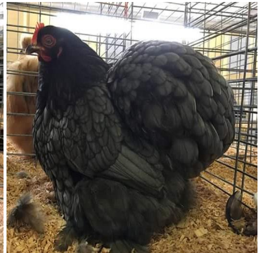
Ciera Walter's Large Fowl Blue Reserve Breed