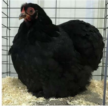
Linda Blackman's Black Hen Little Rhody Show