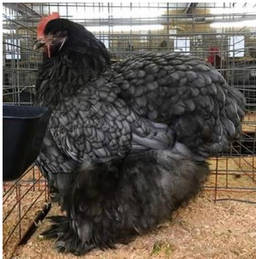
Sheryl Butler's Blue Bantam Reserve Breed