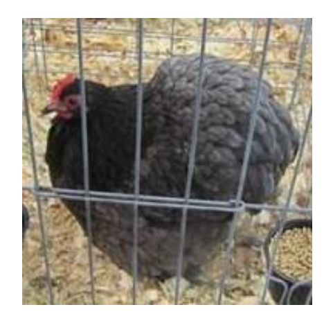
BV Blue Bantam Pullet by Nancy Compton