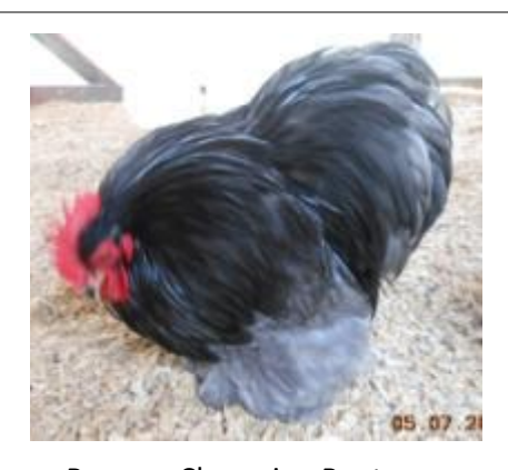
Reserve Champion Bantam Best of Variety Blue Cockerel by Nancy Compton