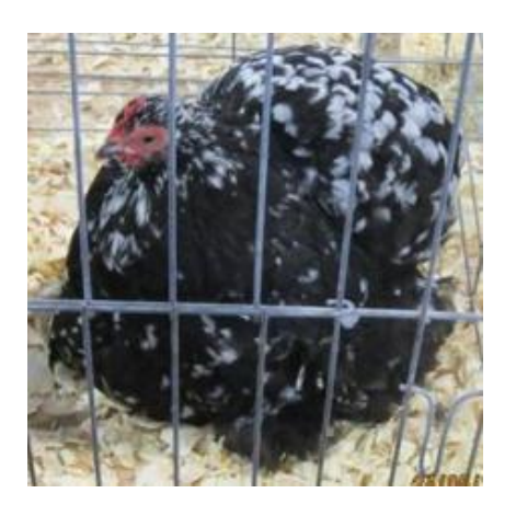
BV Mottled Bantam Hen