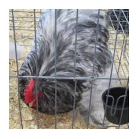
1<sup>st</sup> Splash Bantam Cockerel by Bruce Robinson