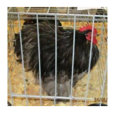
RV Blue Bantam Cockerel by Nancy Compton