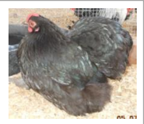
GRAND CHAMPION of SHOW Champion Bantam - Best of Variety Black Pullet by Nancy Compton