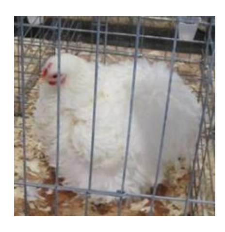
RV White Frizzle Bantam Pullet by M&M Exhibition Poultry