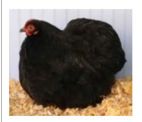
Super Grand Champion Black Hen by Tom & Sandra Roebuck