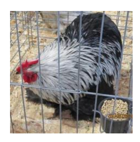
RV Birchen Bantam Cockerel by Nancy Compton