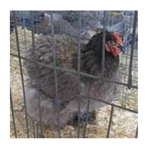
RV Blue Large Fowl Hen by Jodi Frye