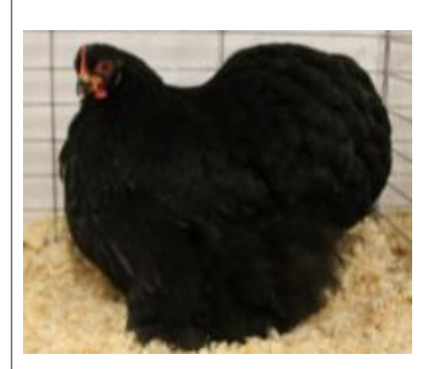
GRAND CHAMPION of SHOW Champion Bantam Best of Variety Black Pullet by Edison Cigany