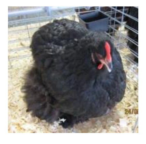
BB & BV Black Large Fowl Hen by Jodi Frye