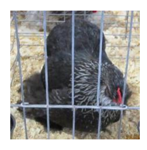
BV Birchen Bantam Pullet by Nancy Compton