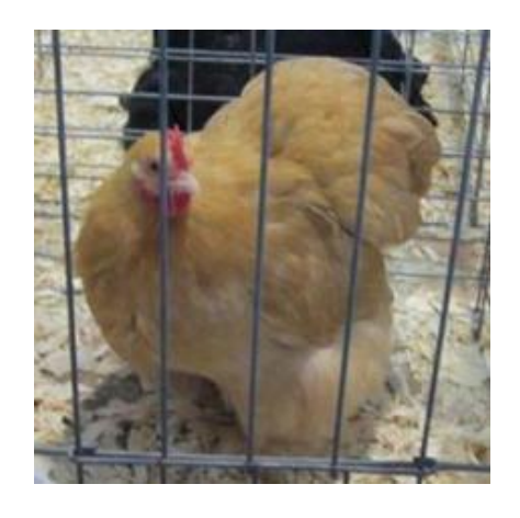
BV Buff Bantam Pullet by Bud Blankenship