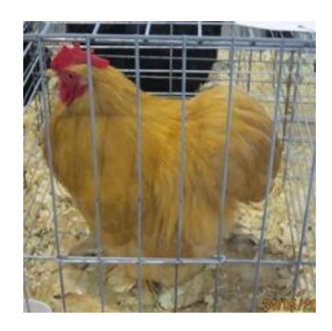
RV Buff Bantam Cockerel by Bud Blankenship