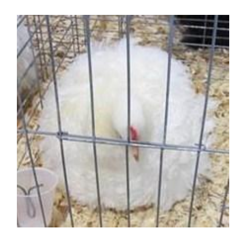
BV White Frizzle Bantam Pullet by M&M Exhibition Poultry