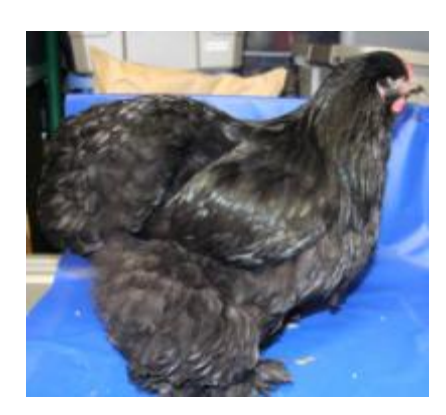
Reserve Champion Large Fowl Reserve of Variety Black Pullet by Ciera Walters