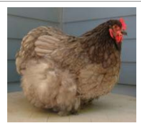
Reserve Champion Large Fowl Best of Variety Blue Hen by Jodi Frye