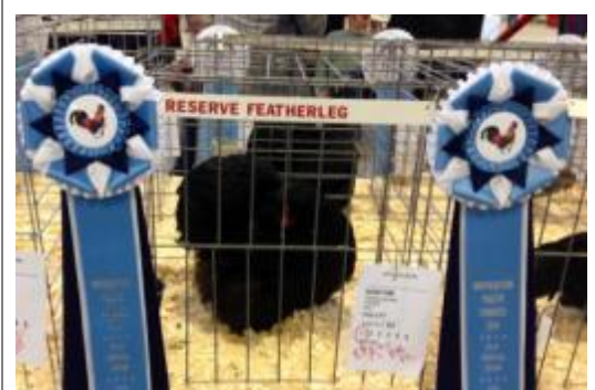
Reserve Feather – Leg Black Pullet by Judy Gantt