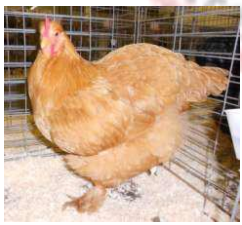
BV Large Buff Pullet