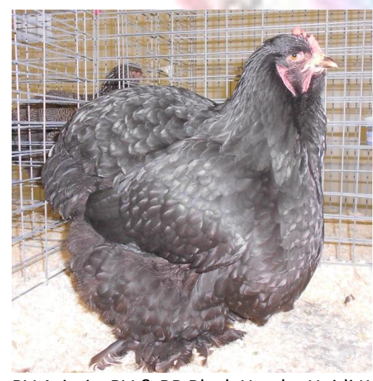
RV Asiatic, BV & BB Black Hen