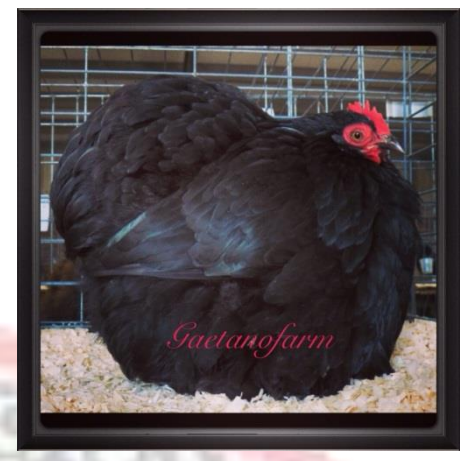
NEBC Black Cochin Hen

This year's CI NE1 District Meet will be held at the Eastern NY State Poultry Association fall show in Cobleskill, NY on September 29. I believe this is their 50<sup>th</sup> show so I'm sure it will be a show to remember. I'll be sending out letters in the summer with more information and soliciting awards for this district meet. More information can be found at <a href="http://enyspassc.com/">http://enyspassc.com/</a>. This is a well-run show in a beautiful area. I am planning to attend and hope many others can as well.