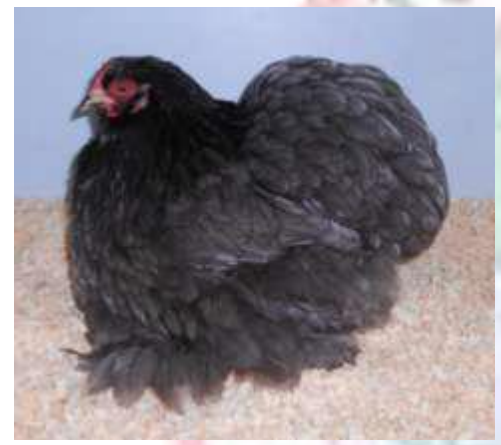
BV Bantam Blue Hen