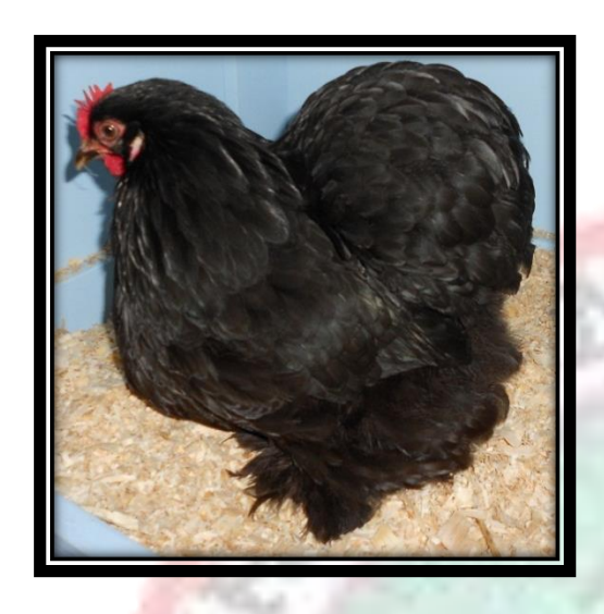
Black, Blue, White, Brown Red, Frizzle Cochin Bantams