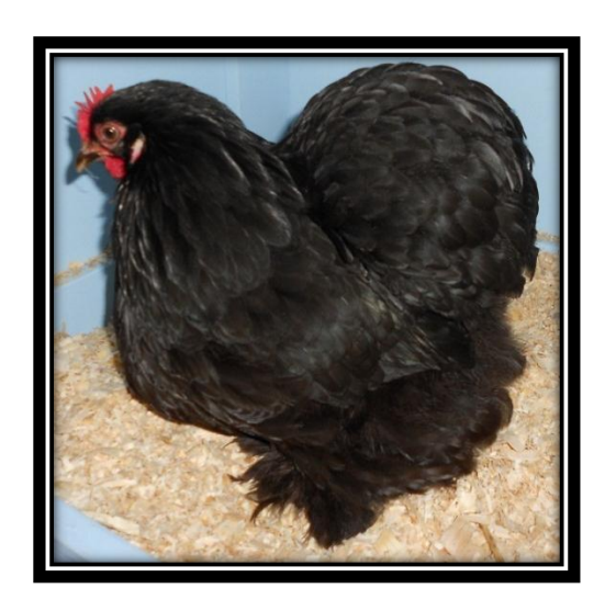
Black, Blue, White, Brown Red, Frizzle Cochin Bantams