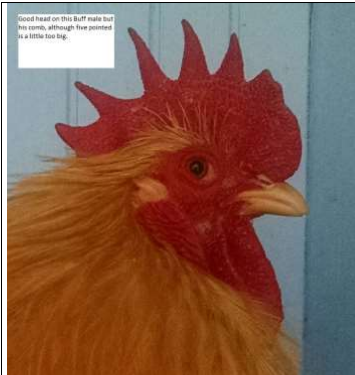
Good head on this Buff male but his comb, although five pointed is a little too big.