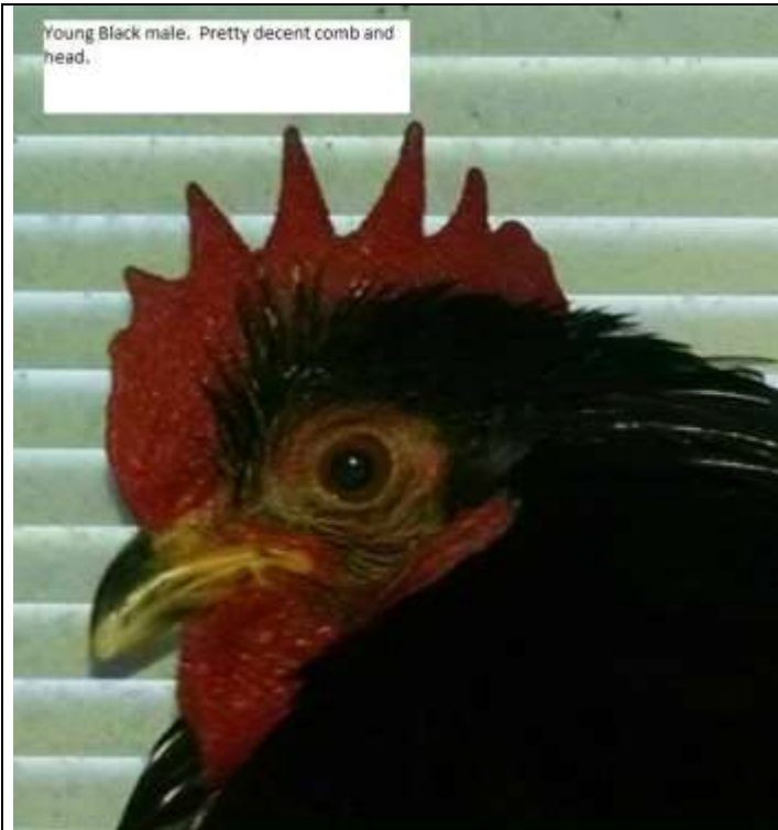
Young Black male. Pretty decent comb and head.