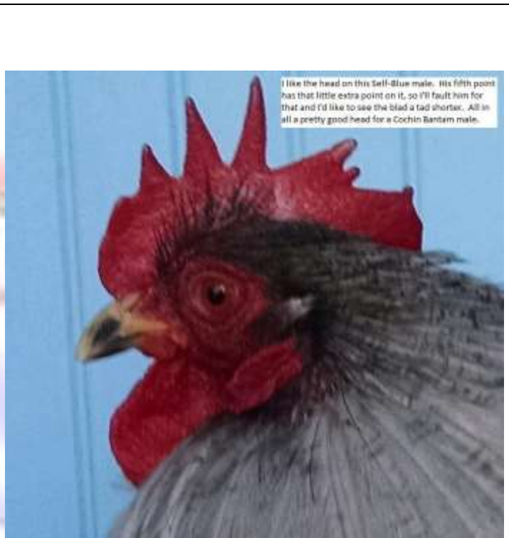
I like the head on this Self-Blue male. His fifth point has that little extra point on it, so I'll fault him for that and I'd like to see the blade a tad shorter. All in all a pretty good head for a Cochin Bantam male.