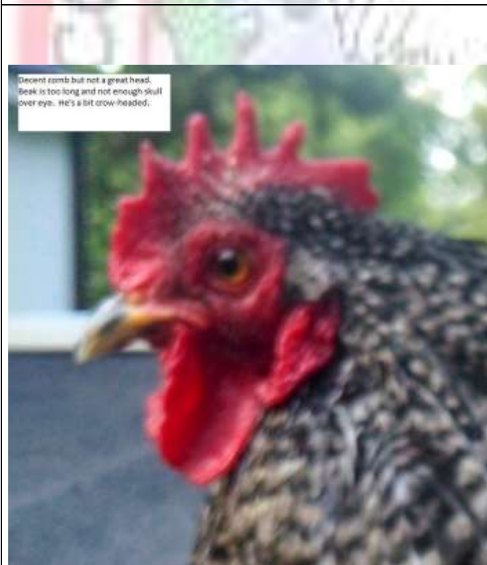
Decent comb but not a great head. Beak is too long and not enough skull over eye. He's a bit crow-headed.