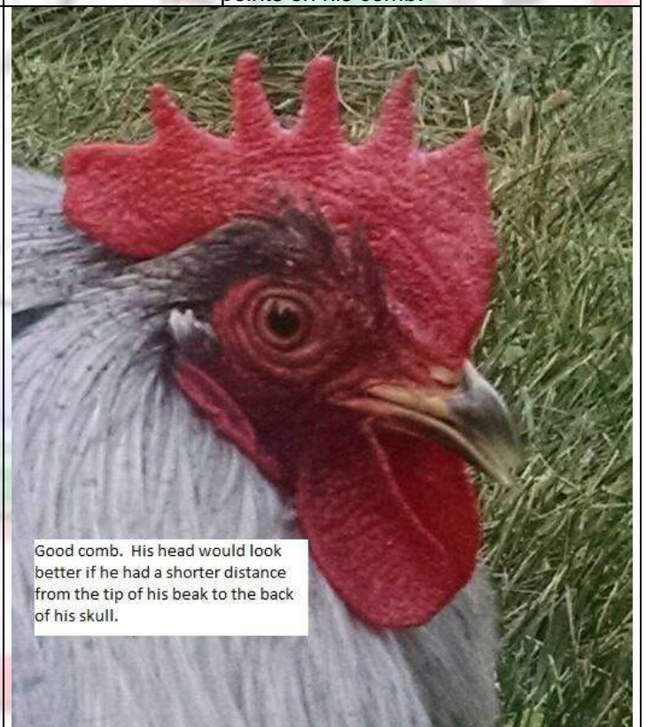
Good comb. His head would look better if he had a shorter distance from the tip of his beak to the back of his skull.