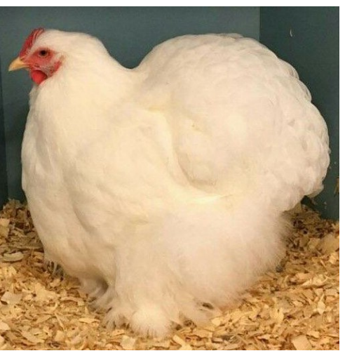
Reserve Overall Cochin, LF Best of Breed White Hen By Tom & Sandra Roebuck