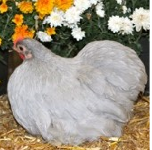
Bantam Self Blue RV (not recognized) Pullet by Edison Cigany