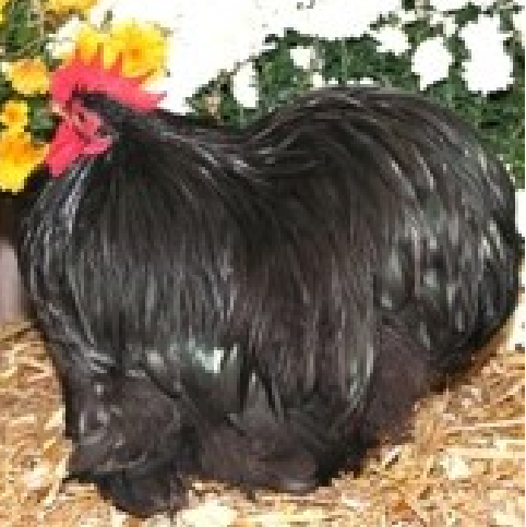
Bantam Black RV Cockerel by Tom & Sandra Roebuck