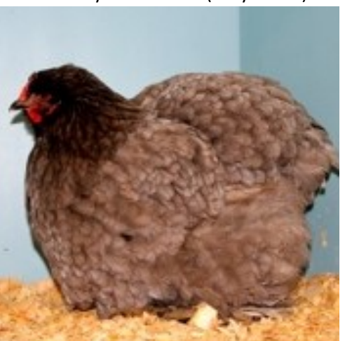
Large Fowl Blue BV Pullet by Carlee Luckenbach