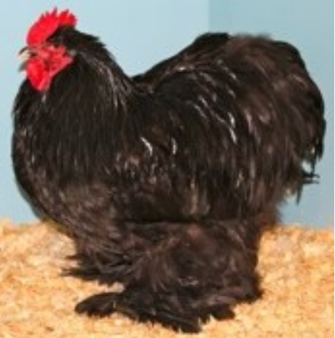
Large Fowl Black RV Cockerel by Carlee Luckenbach