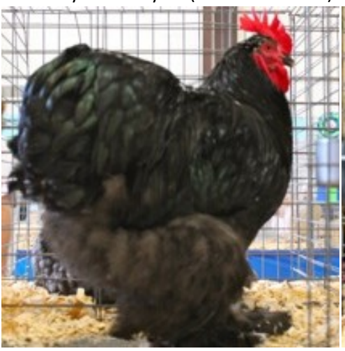
Large Fowl Mottled RV Cockerel by Elton Minnich