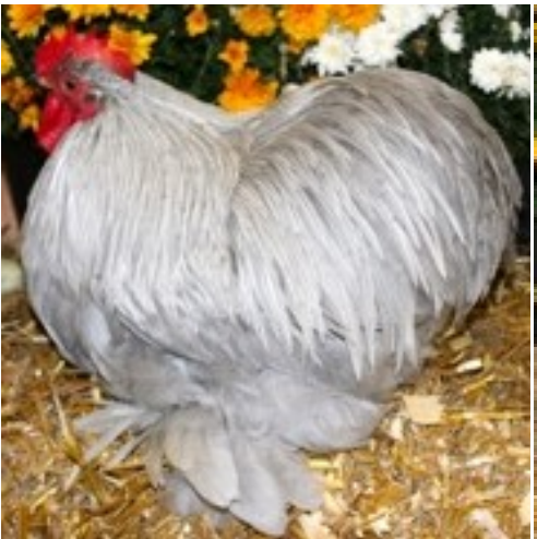
Bantam Self Blue BV (not recognized) Cock by Edison Cigany