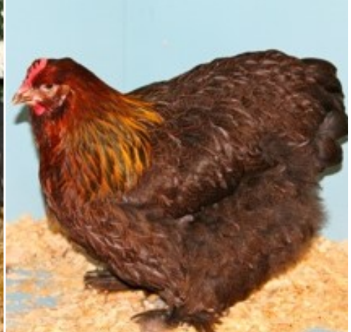
Reserve AOV LF, BV Partridge Pullet By Rich Barczewski