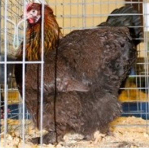
Large Fowl Partridge RV Pullet by Rich Barczewski