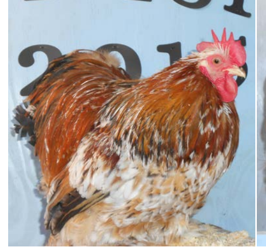
BV Mille Fleur Bantam Cockerel