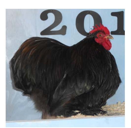
Reserve of Breed Bantam Black Cockerel by Jay Yobst