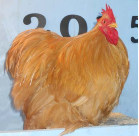
RV Buff Bantam Cock