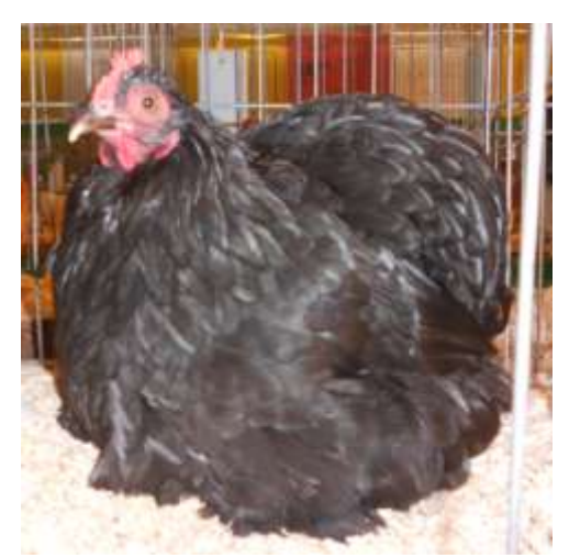
Best of Breed and BV Bantam Black Hen by Top Line Poultry/George Smallman