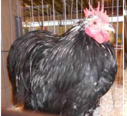
BV Mottled Bantam Cockerel by Alan Bennett