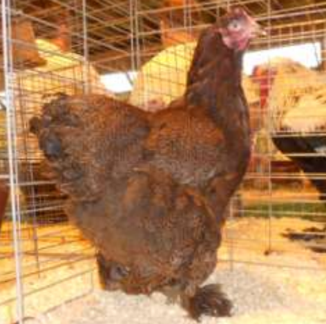
RV Partridge Large Fowl Hen