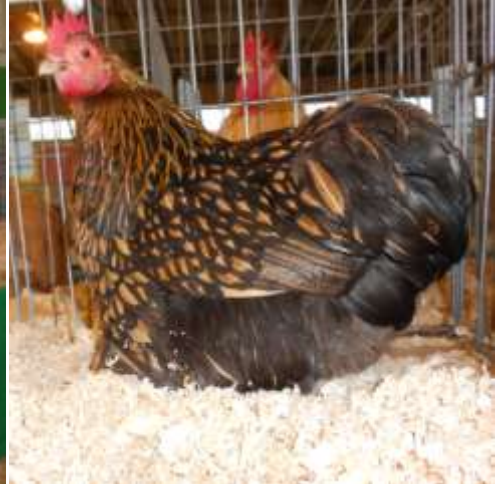
RV Golden Laced Bantam Hen