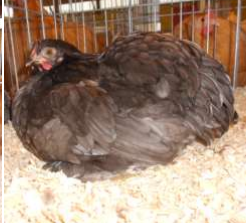
RV Blue Bantam Pullet by Alan Bennett