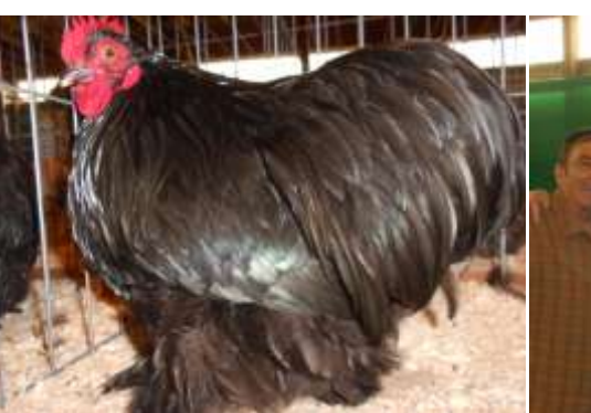
Reserve of Breed and RV Bantam Black Cock by Top Shelf Blacks/Ed Thompson