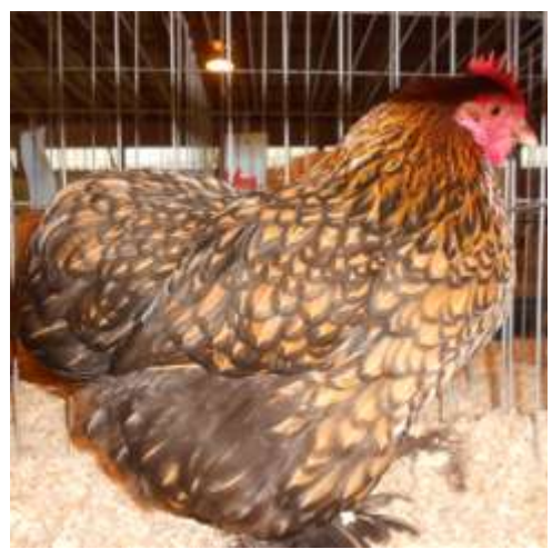
BV Golden Laced Bantam Hen