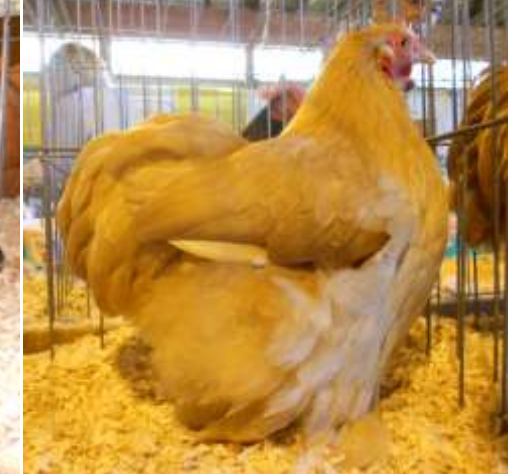
BV Buff Bantam Pullet