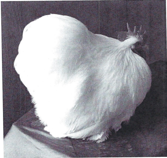
BV White Bantam, 2008 Eastern National Meet, a cock, by Maxie Chastain