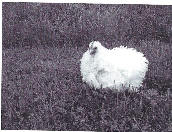
BV White Frizzle Bantam, 2008 Eastern National Meet, a hen