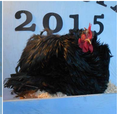
RV Black Frizzle Bantam by Teresa Kuras