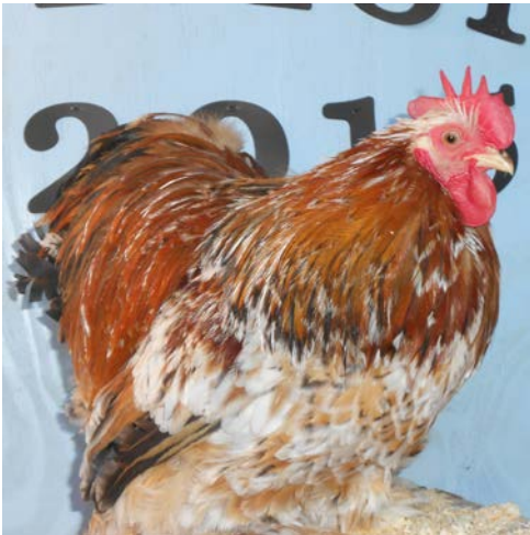
BV Mille Fleur Bantam Cockerel