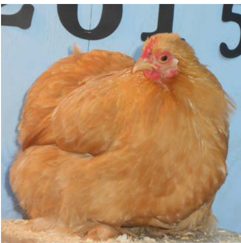
BV Buff Bantam Hen