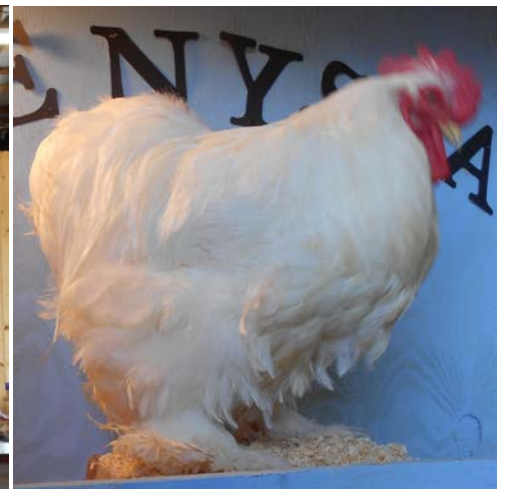
RV White Large Fowl Cock by Kay St. Amour