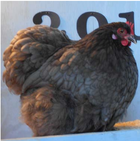
BV Blue Bantam Pullet by Judy Gantt