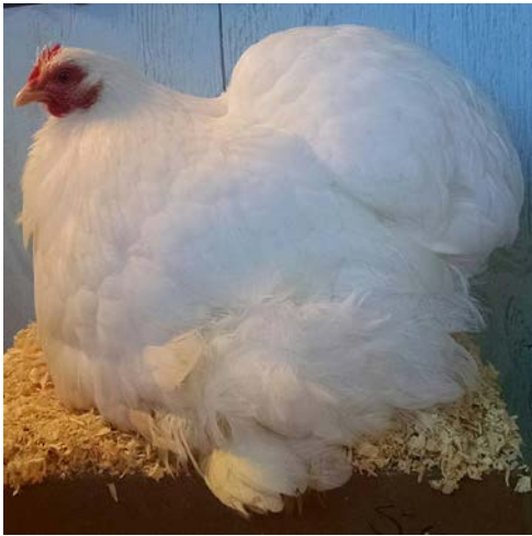
BB, Ch. FL, & Ch. Bantam of Show White Hen by Lisa Podgwaite/Dog River Bantams

In the Open Show, 116 Bantams and 9 Large Fowl were shown.