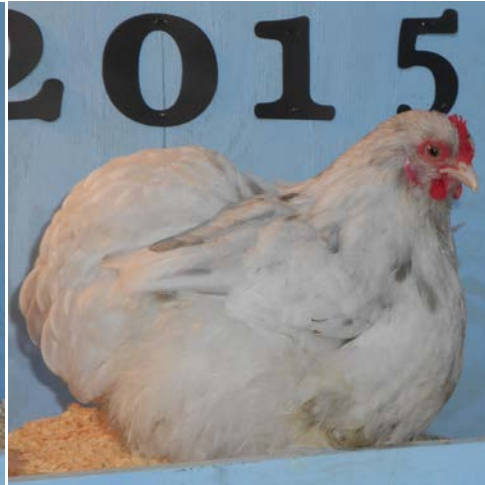
RV Splash Bantam Pullet