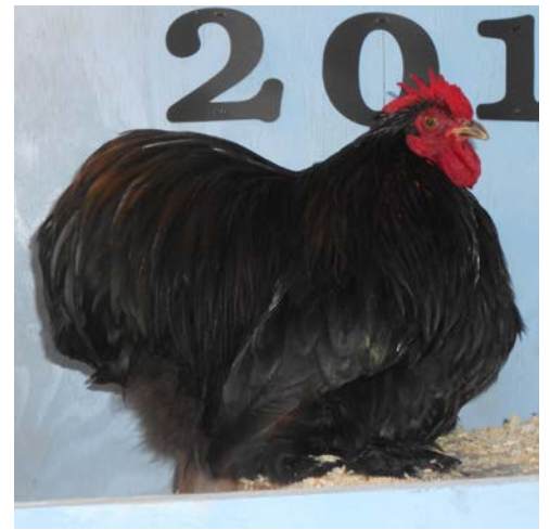
Reserve of Breed Bantam Black Cockerel by Jay Yobst