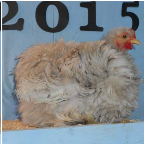
RV Splash Frizzle Bantam Pullet