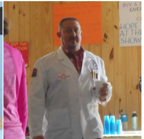
Judge Tom Roebuck