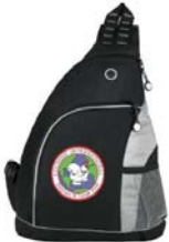
Sling Backpack $21.00 + s/h