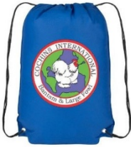
Drawstring Bag $15.00 + s/h