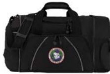
Large Duffel Bag $28.00 + s/h