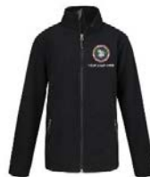
Fleece Jacket w/Logo & Your Name $42.00 + s/h