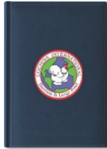
Journal/Notebook $12.00 + s/h