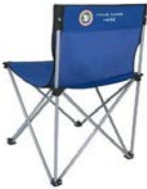
Chair w/Logo & Your Name $33.00 + s/h