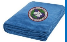
Fleece Blanket $35.00 + s/h