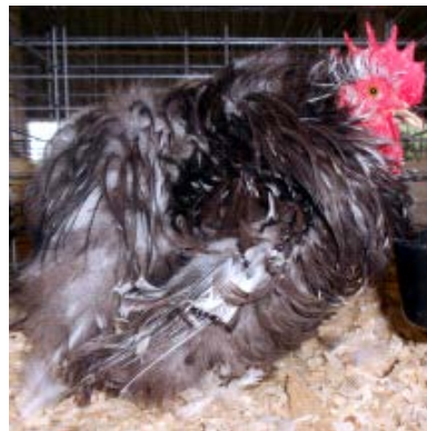
BV Blue Frizzle Bantam Cock by Judy Gantt