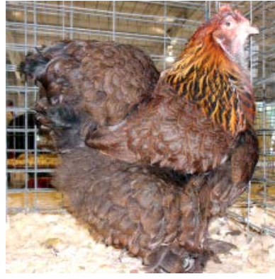
RV Large Fowl Partridge Hen