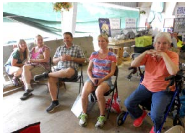
CI members enjoying the show and trying to stay cool!