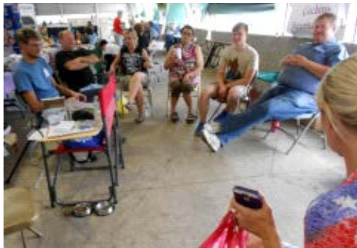
CI members having a discussion.