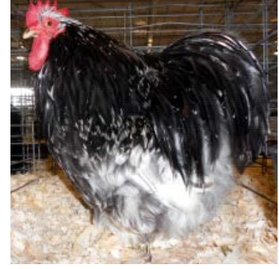
BV Blue Mottled Bantam Cock by Judy Gantt