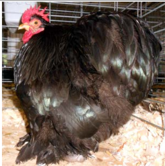
Overall Champion Cochins, BB & BV Black Bantam Cockerel