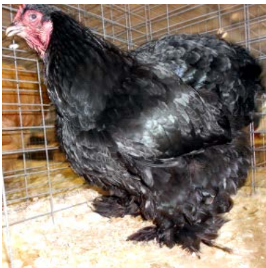
BV Large Fowl Black Hen by Dustin Drake