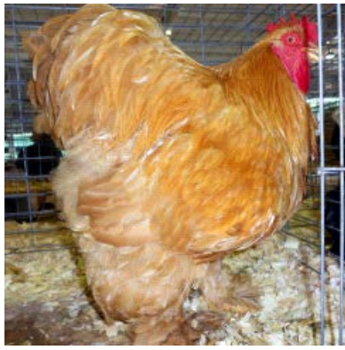
BV Large Fowl Buff Cock by Jay Yobst