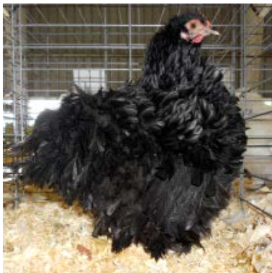
RV Black Frizzle Bantam Pullet by Meredith Hoover