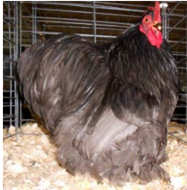
RV Blue Bantam Cock by Matt McCammon