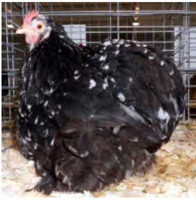
RV Mottled Bantam Pullet by Matt McCammon