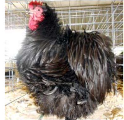
BV Black Frizzle Bantam Cock by Judy Gantt