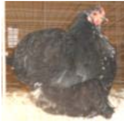
BV Mottled Btm Pullet