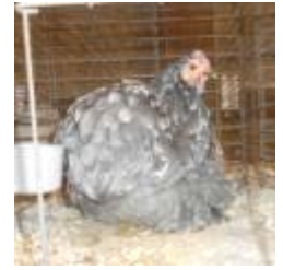
BV Blue Mottled Btm Hen by Darren Wegg