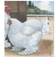
CAMERA SHY!!! RV Large Fowl White Pullet by Kay St Amour