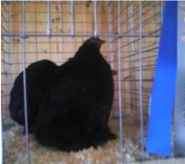
Junior BB Black Btm Pullet by Edison Cigany