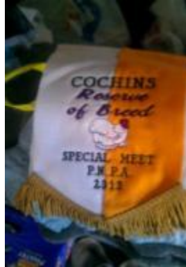
Cochins RB Special Meet Banner