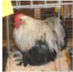
RV Birchen Btm Cock by Nancy Compton