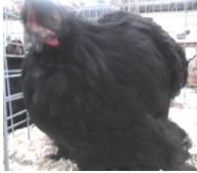
RB Black Btm Pullet by Becky Salinger