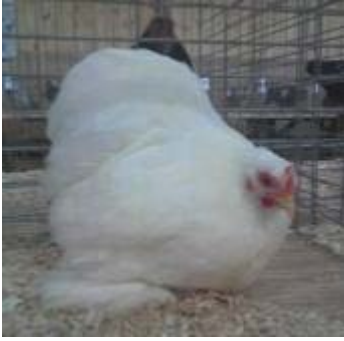
BB White Btm Pullet by Don Sidor