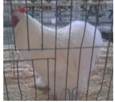
BB White Large Fowl Cock by Jamie Matts