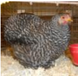
RV Barred Btm Pullet by Becky Salinger & Gypsy Ridge Farm