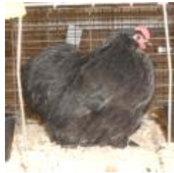
BV Birchen Btm Pullet by Nancy Compton