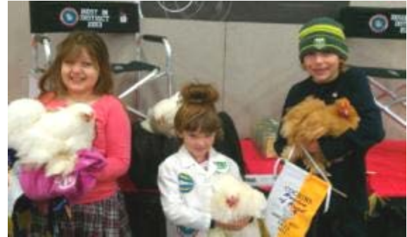
Juniors Winners of the District Meet