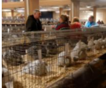
Here are some members having a chat.