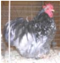
RV Blue Mottled Kockerel by Judy Gantt