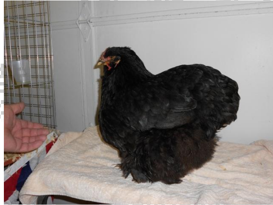
2011 Western Regional Reserve of Breed Champion LF Black Pullet by Lin Scharnhorst