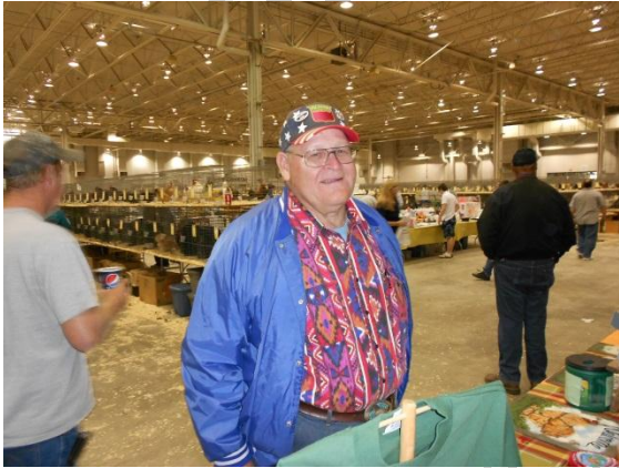
A Cochon member attending the 2011 Indy Show.