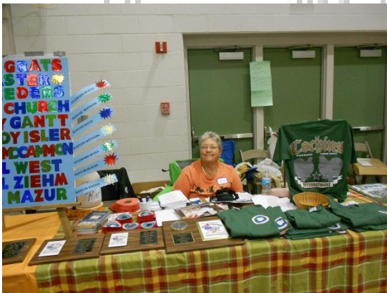
Your president at the 2011 Indy Show.