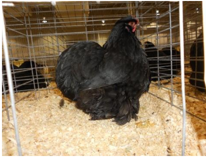
2011 Best of Breed Bantam and overall Champion Black Pullet by Joe Mazur.